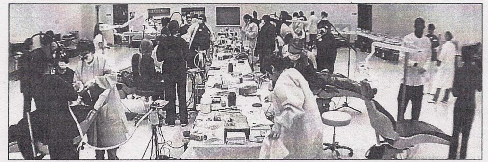
Ebenezer Baptist Church was transformed May 13 and 14 into a sprawling dental lab. The students are part of a two-year program at the Virginia Beach Technical Education Center.